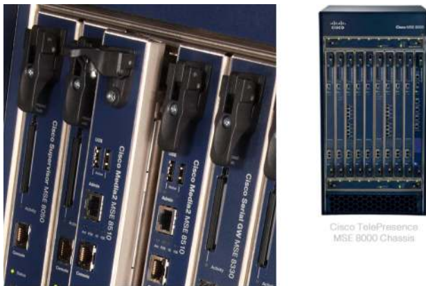
Figure 1. Cisco TelePresence MCU MSE 8510

The Cisco TelePresence ® MCU MSE 8510 blade is the industry's leading chassis-based, high-definition (HD) multimedia conferencing bridge (Figures 1 and 2). It delivers superior video and voice with an easy-to-use, versatile management interface. Compatible with all major vendors' endpoints (Figure 3), it maintains its capacity and performance in every configuration, delivering the best experience for each participant, every time.