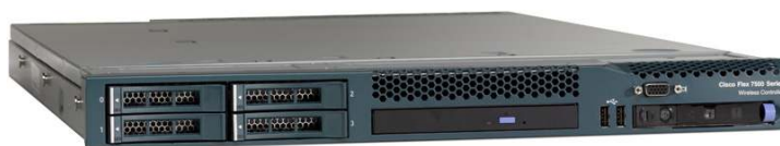
Figure 1: Cisco Flex 7500 Series Cloud Controller

The Cisco Flex 7500 Series (Figure 1) can manage wireless access points in up to 6000 branch locations. This controller allows IT managers to configure, manage, and troubleshoot up to 6000 access points and 64,000 clients from the data center. The Cisco Flex 7500 Series controller supports secure guest access, rogue detection for Payment Card Industry (PCI) compliance, and in-branch (locally switched) Wi-Fi voice and video.