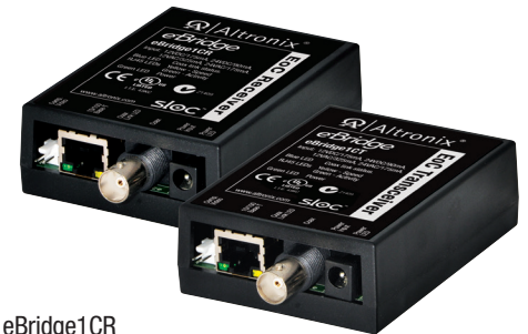
eBridge1CR and eBridge1CT

Altronix eBridge1CRT IP over Coax transceiver and receiver kit is designed to enable fast 10/100Base-T Ethernet digital communication over coax cable. These plug and play units facilitate system upgrades from analog to IP cameras/devices utilizing existing legacy Coax and eliminating the costs and labor associated with installing new network cabling. In addition, data transmission is extended up to 610m (over five times the 100m Ethernet maximum length), eliminating the need for repeaters. eBridge units transmit composite video signal with Ethernet data simultaneously.