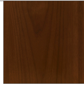
Natural Walnut Veneer