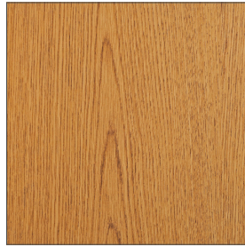
Light Oak Laminate