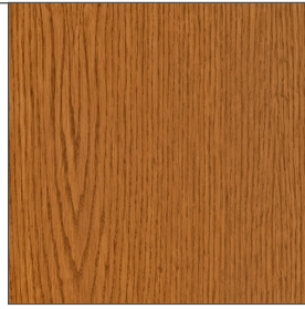
Medium Oak Veneer