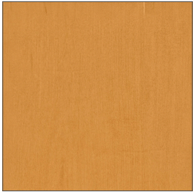
Honey Maple Veneer