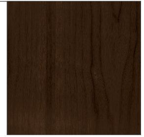
Heritage Walnut Veneer