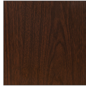
Gunstock Walnut Laminate