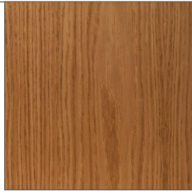
Light Oak Veneer