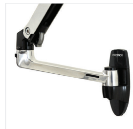
LX EXTENSION INCREASES REACH BY 9" (23 CM) WHITE (45-289-216) POLISHED ALUMINUM (45-289-026) MATTE BLACK (45-289-224)