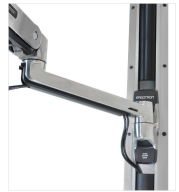
RECOMMENDED: ATTACH WALL MOUNT ARM TO AN ERGOTRON WALL TRACK USING BRACKET (97-091)