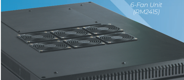
6-Fan Unit (RM2415)