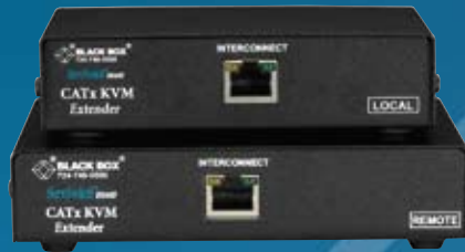
ACU6001A (front view)