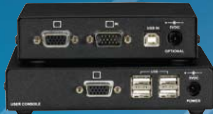
ACU6001A (rear view)