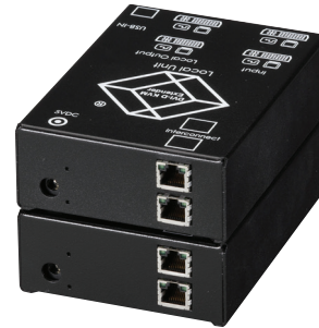
ACS4201A-R2 Local and Remote Units