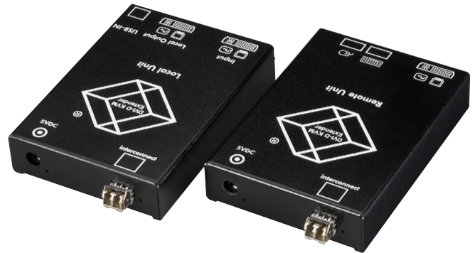
ACS4001A-R2-SM Local and Remote Units