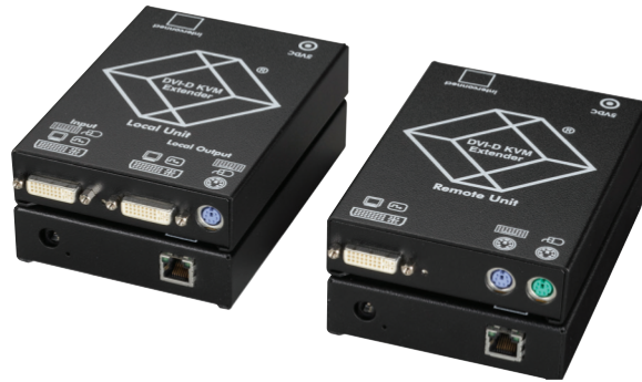
ACS2009A-R2 Local and Remote Units