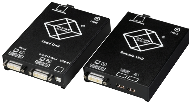
ACS4001A-R2-SM Local and Remote Units