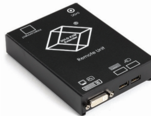
ACS4001A-R2 Remote Unit