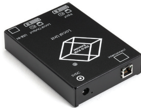
ACS4001A-R2 Local Unit