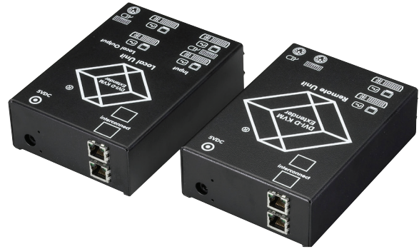
ACS2209A-R2 Local and Remote Units