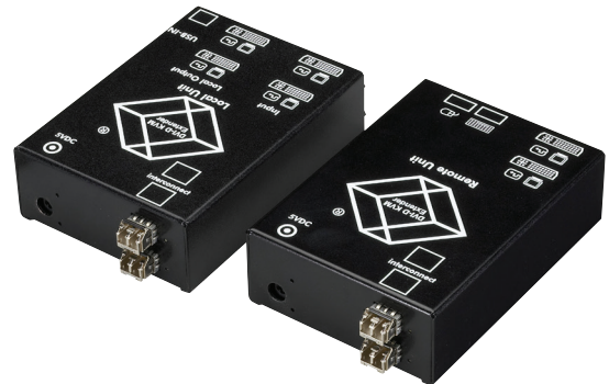
ACS4201A-R2-SM Local and Remote Units