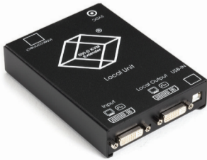
ACS4001A-R2 Local Unit