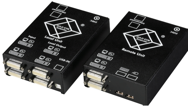
ACS4201A-R2-SM Local and Remote Units