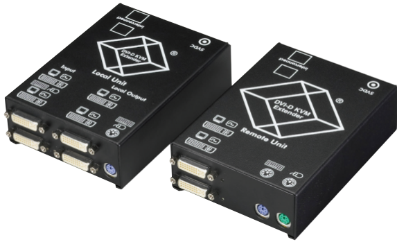
ACS2209A-R2 Local and Remote Units