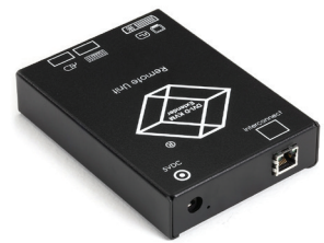
ACS4001A-R2 Remote Unit