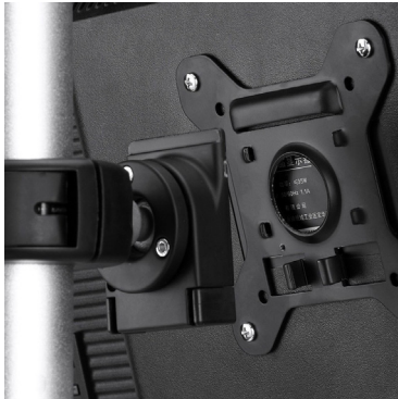
Quick display release mechanism for easy installation.