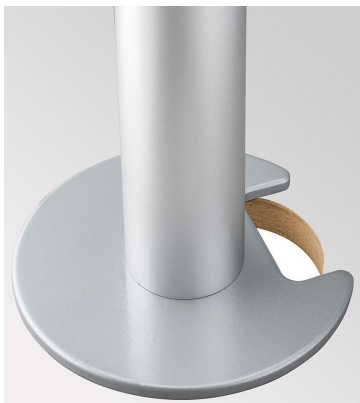
Can be used as a bolt through option or fitted into a grommet hole (2.36"-3.15" in diameter).