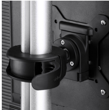
Tool-free independent display position adjustment with QuickShift™ lever.