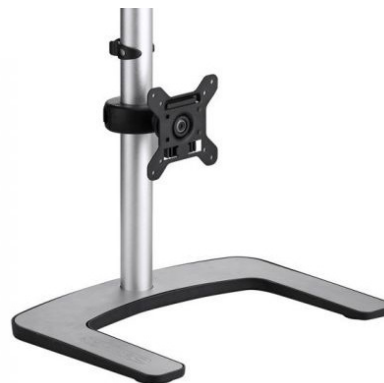
Doesn't require desk fixing. Freestanding base: 16.6" x 12".