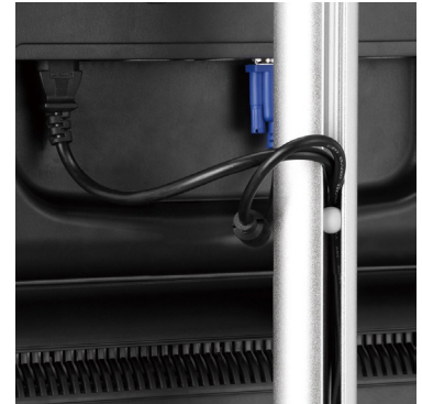
Advanced cable management.