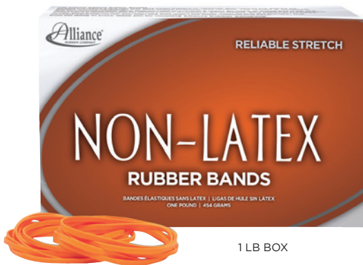
1 LB BOX