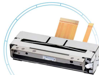
PRINT MECHANISMS a mechanism to fit every application