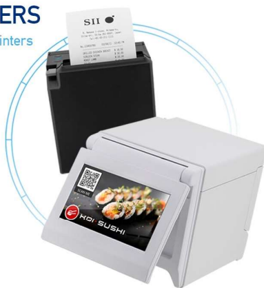
POS PRINTERS innovation in pos printers