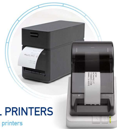
LABEL PRINTERS smart label printers