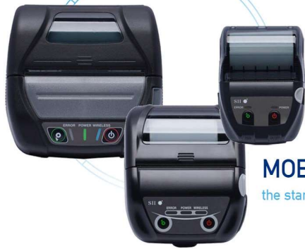
MOBILE PRINTERS the standard for mobile printers