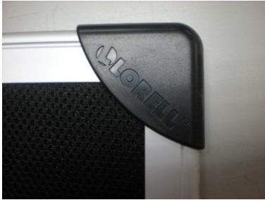
Corner with front cover

Step 1: Remove front cover of 4 corner pieces to access mounting holes