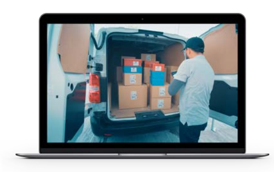
ET40/ET45 Product Overview Video