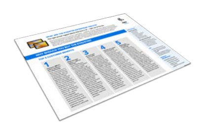
Top 5 Reasons Customers Should Buy ET40/ET45 Enterprise Tablets