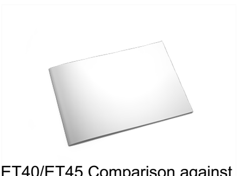
ET40/ET45 Comparison against Consumer Devices One Pager Coming soon