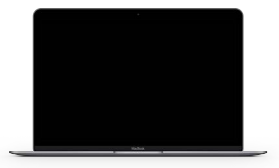
ET40/ET45 Pre-Launch Training Video Coming soon