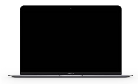
ET40/ET45 Snackable Short Video Coming soon