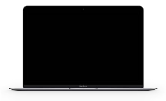
ET40/ET45 Snackable Short Video Coming soon