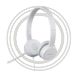
Lenovo 110 USB Stereo Headset