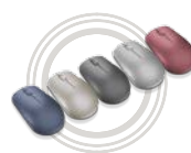
Lenovo 530 Wireless Mouse