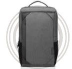
Lenovo 15.6" Laptop Urban Backpack B530