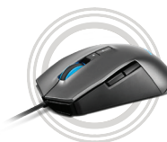
Lenovo IdeaPad Gaming M100 RGB Mouse