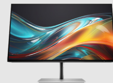
HP Series 7 Pro 23.8" FHD Monitor - 724pf