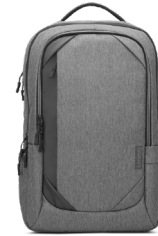
Lenovo Business Casual 17-inch Backpack