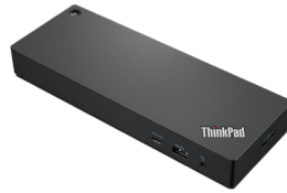
ThinkPad Universal Thunderbolt™ 4 Dock