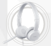
Lenovo 110 USB Stereo Headset