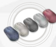
Lenovo 530 Wireless Mouse