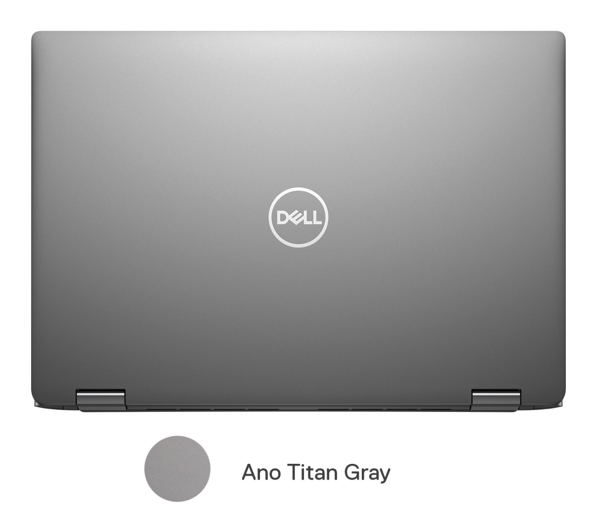
Table 44. CMF specifications