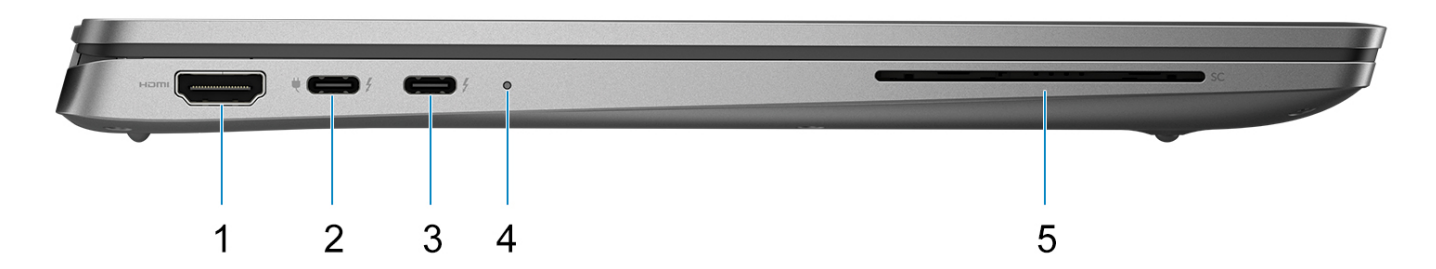
Figure 2. Left view