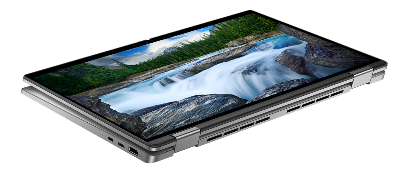
Figure 8. Image: Tablet mode