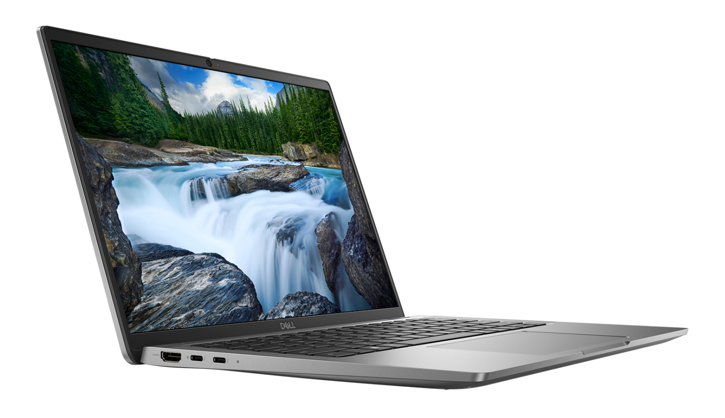
Figure 7. Image: Notebook mode