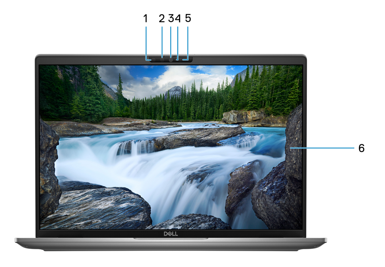
Figure 3. Image: Front view