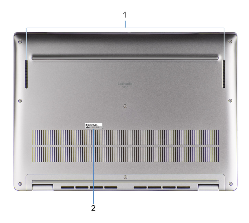
Figure 5. Image: Bottom view