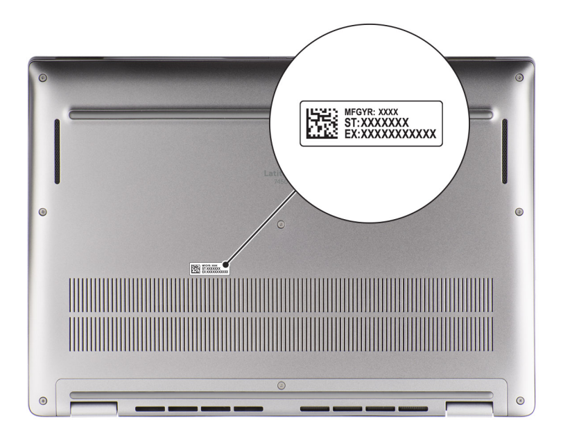
Figure 6. Image: Service Tag location