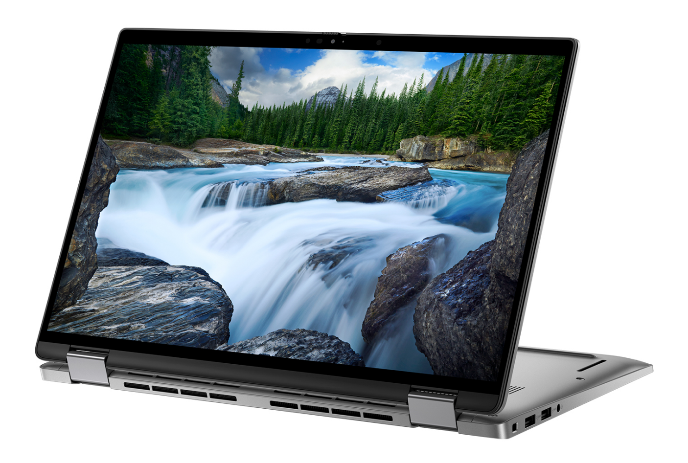
Figure 9. Image: Stand mode