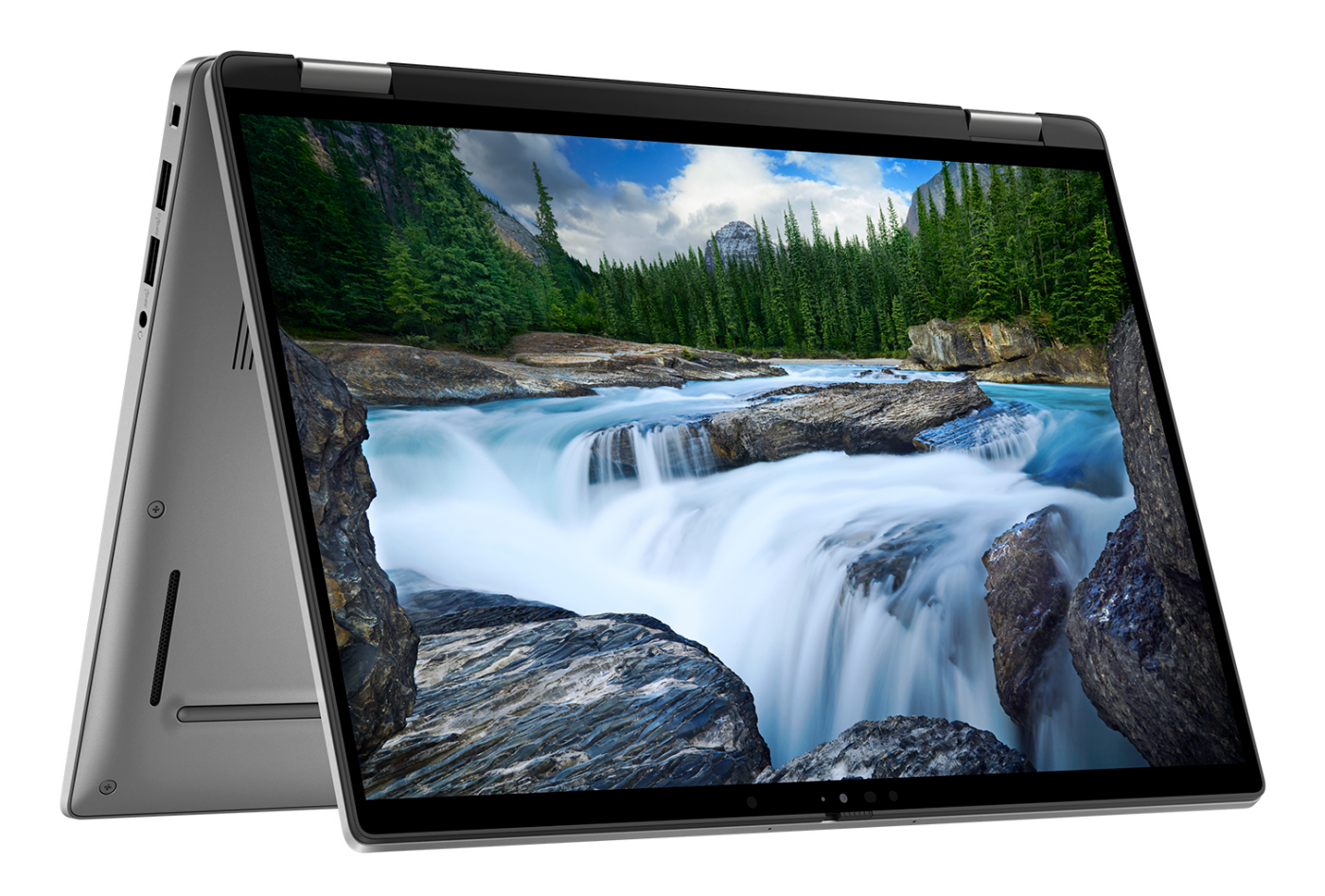
Figure 10. Image: Tent mode