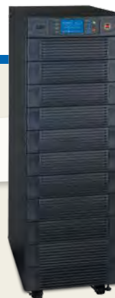
SmartOnline 3-Phase UPS Systems provide high-capacity centralized power.