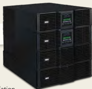
SmartPro® Line-Interactive UPS Systems provide automatic voltage regulation.