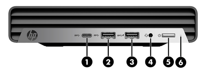
Table 2-1 Identifying the front panel components

NOTE: Drive configuration varies by model. Some models have a bezel blank that covers one or more drive bays.