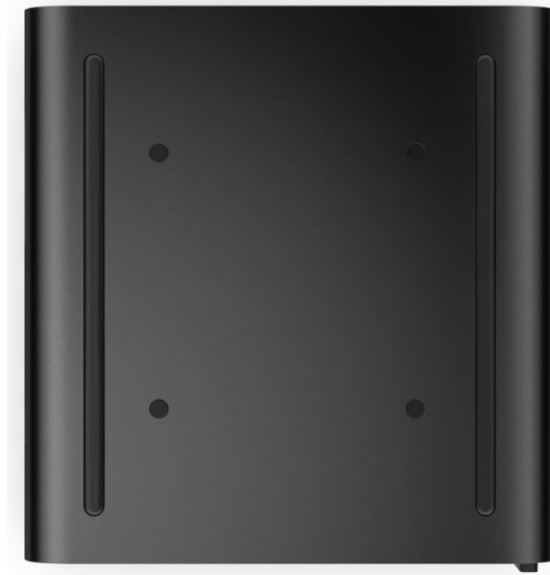
HP Z2 G9 Mini Workstation Desktop PC, bottom view

Removable VESA cap for access to integrated VESA mounting holes