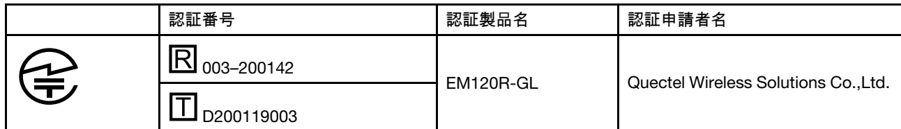
Table 1. 無線 WAN アダプター

本製品が装備する無線アダプターは、電波法および電気通信事業法により技術基準認証を下記のとおり取得しています。本製品に組み込まれた無線設備を他の機器で使用する場合は、当該機器が上記と同じく認証を受けていることをご確認ください。認証されていない機器での使用は、電波法の規定により認められていません。