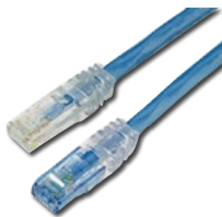
Keyed UTP Copper Patch Cords

Keyed patch cord type is indicated by patch cord color. Select a jack (above) of the same color as the patch cord to match the keyed configuration.