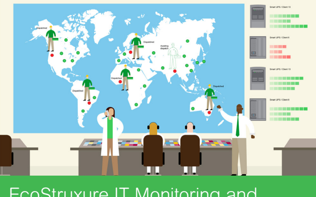
EcoStruxure IT Monitoring and Dispatch

Ideal for distributed IT sites and businesses with mixed IT environments.