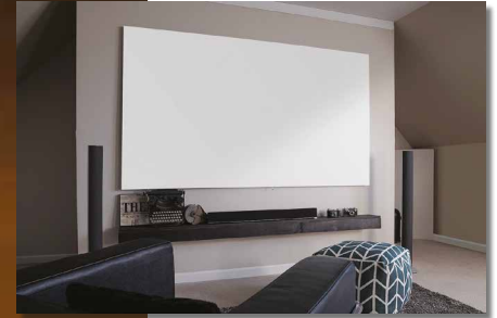
Sleek EDGE FREE® Design