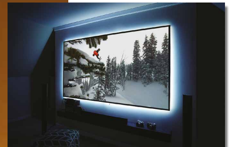
Optional LED backlight kit

The Aeon Series is a fixed frame projection screen that uses Elite's EDGE FREE® technology. EDGE FREE® means that there is no external framework (edge) bordering the material as seen in traditional frame-screens. The design utilizes an internal frame with wrap-around material that resembles a giant size flat panel display. The Aeon includes a black velvet trim edge strip as an option to further enhance the overall appearance.