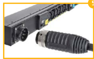
Front-entry input (End-entry input models available)

High outlet density Best-in-class 42 outlets (select models) in a 42U design power crowded racks.