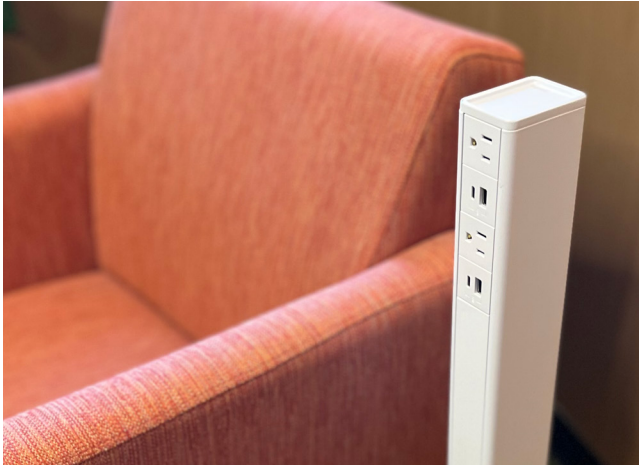
Easily relocatable power tower that can be configured to meet the needs of your space.