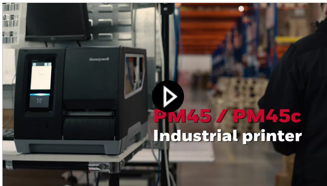
Honeywell PM45 Printer Video