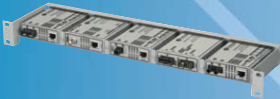
LMC205: shown with modules