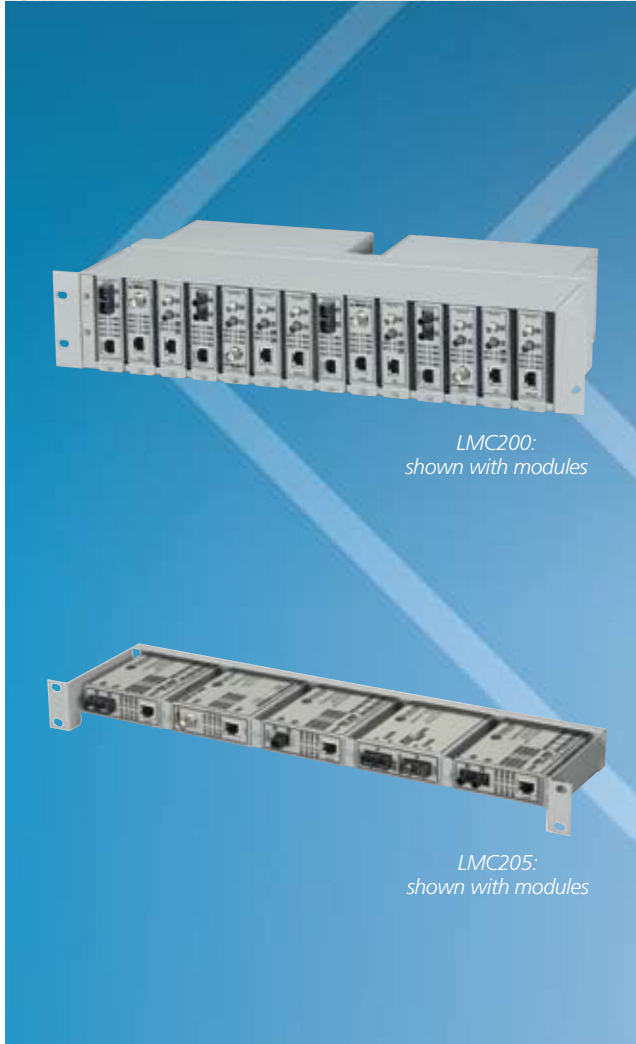
LMC200: shown with modules