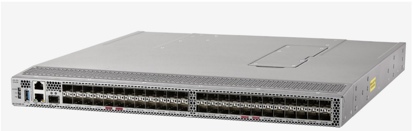
HPE Storage Fibre Channel Switch C-Series SN6720C

The SN6720C can be provisioned, managed, monitored, and troubleshot using Nexus Dashboard Fabric Controller (NDFC) (previously called Data Center Network Manager (DCNM)), which currently manages the entire suite of Cisco data center products. Powered by C-series MDS 9000 NX-OS Software, it includes storage networking features and functions and is compatible with C-series SN8700C (MDS 9700) Series Multilayer Directors, C-series SN6010C (MDS 9148S) Multilayer Fabric Switches, C-series SN6610C (MDS 9132T), C-series SN6620C (MDS 9148T) Multilayer Fabric Switches, C-series SN6630C (MDS 9396T) Multilayer Fabric Switches, C-series SN6710C (MDS 9124V) Multilayer Fabric Switches, and C-series SN6640C (MDS 9220i) Multi-service Fabric Switches, providing transparent, end-to-end service delivery in core-edge deployments.