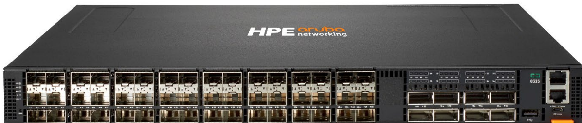
HPE Aruba Networking CX 8325 Switch Series