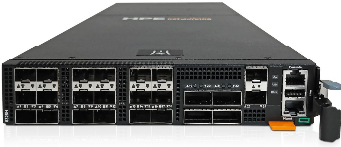
HPE Aruba Networking 8325-18Y4C