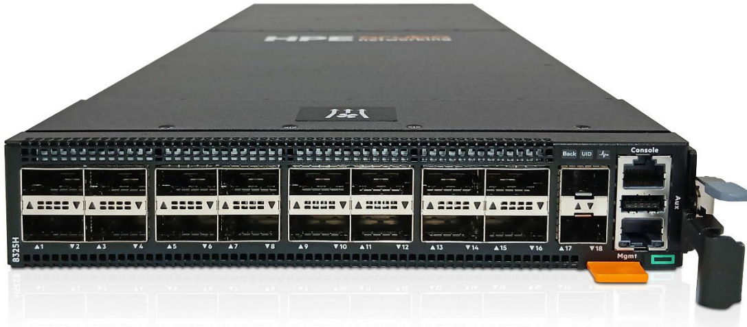
HPE Aruba Networking 8325-16C