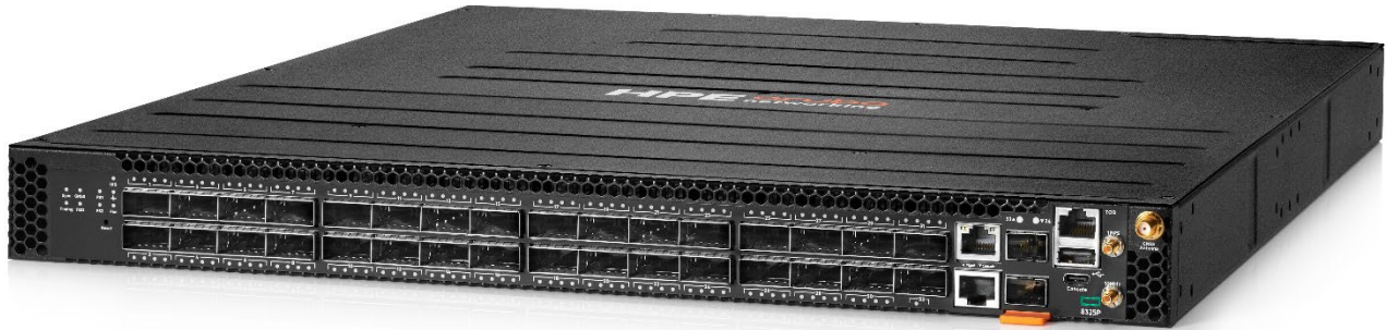
HPE Aruba Networking CX 8325P