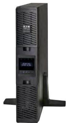
Mount the UPS in a rack or use the included tower stands for vertical placement.