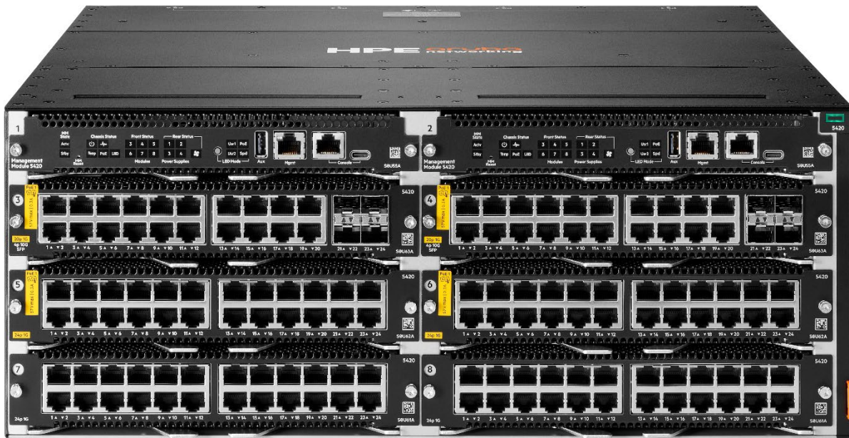
HPE Aruba Networking CX 5420 Switch Series

Notes: *Hardware capable. Software support available in future releases.