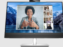
HP Series 5 Pro - 527pm