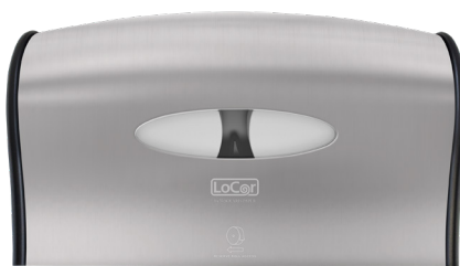
Stainless | D67041