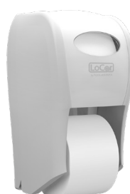
White | D67012