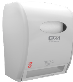
White | D68002