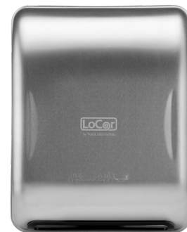
Stainless | D68012