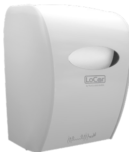
White | D68005