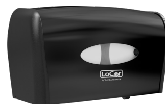
Black | D67023