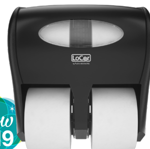
Black | D67053

Our LoCor ® Bath Tissues, 26821 and 26824 are designed for our side-by-side and top down models in both 1000 and 1500-sheet rolls, for maximum efficiency.