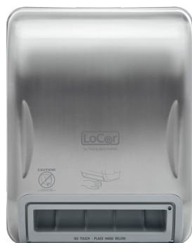
Stainless | D68011