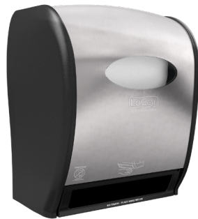
Stainless | D68001