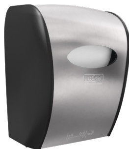
Stainless | D68004