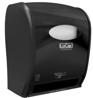
Black | D68003