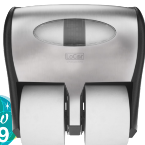
Stainless | D67051