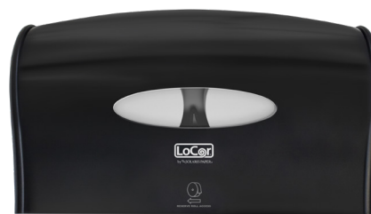
Black | D67043

LoCor ® Jumbo bath tissue works with both Jumbo Bath Tissue dispensers providing 1200' of continuous paper right down to the core.