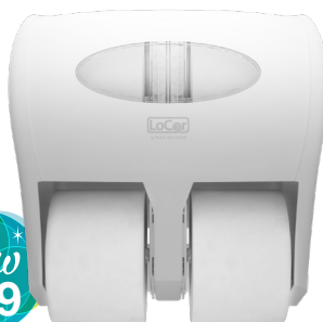
White | D67052