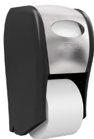
Stainless | D67011