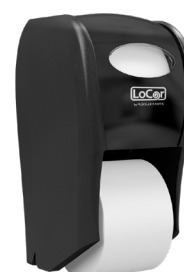
Black | D67013