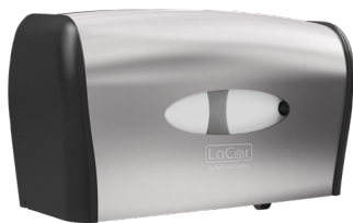
Stainless | D67021