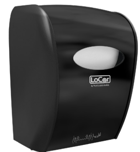
Black | D68006