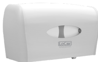
White | D67022