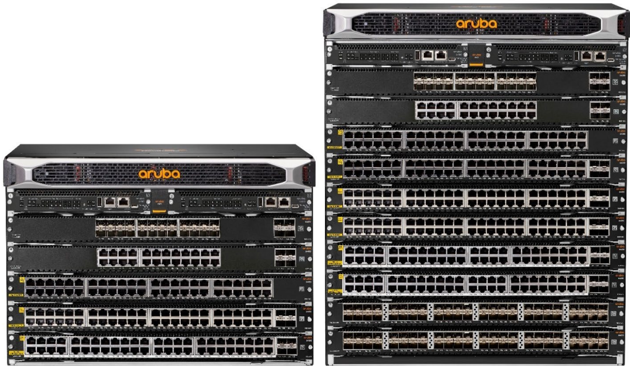
Aruba CX 6400 Switch Series

Aruba Dynamic Segmentation extends Aruba's foundational wireless role-based policy capability to Aruba wired switches. What this means is that the same security, user experience and simplified IT management can be enjoyed throughout the network. Regardless of how users and IoT devices connect, consistent policies are enforced across wired and wireless networks, keeping traffic secure and separate.