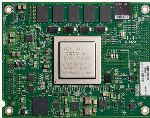
ESS9300 top view

The Cisco® Catalyst® ESS9300 Embedded Series Switch delivers the high-speed and security capabilities needed for real-time, high-bandwidth, mission-critical networking. The 10GE switch comes in a ruggedized, ultracompact form-factor making it ideal for mobile and embedded networks that operate in extreme environments. It enables partners and integrators to build custom solutions for specialized use cases.