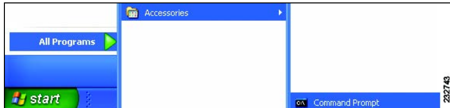
Figure 1 Start > All Programs > Accessories > Command Prompt