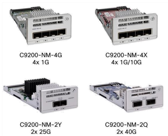
Figure 2. Cisco Catalyst 9200 Series Switch network modules

Cisco Catalyst 9200 Series switches come with modular or fixed uplinks as indicated in Table 1. With modular SKUs, the field-replaceable network modules provide infrastructure investment protection by allowing a nondisruptive migration from 1G to 10G and beyond. When you purchase the switch, you can choose from the network modules described in Table 3.