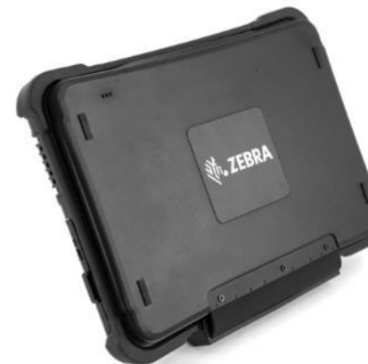
Keyboard in closed position via magnets, protecting display glass