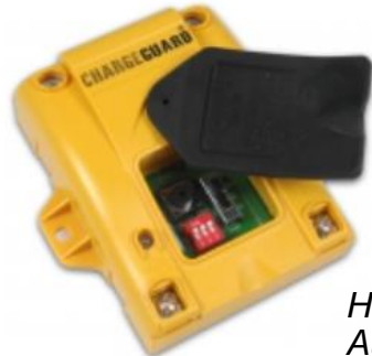
Havis Charge-Guard Auto Shutoff Timer