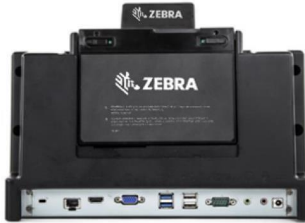
Back view showing optional battery charger (top) and I/O connectivity (bottom)