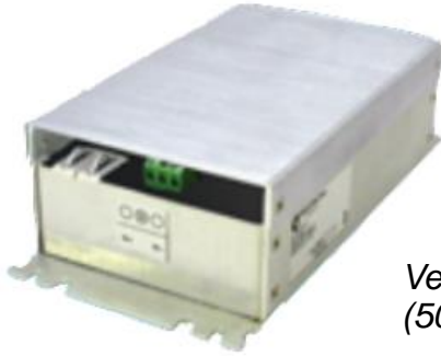
Vehicle Power DC Converter (50-150V or 9-60V)