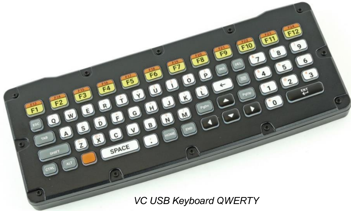
VC USB Keyboard QWERTY