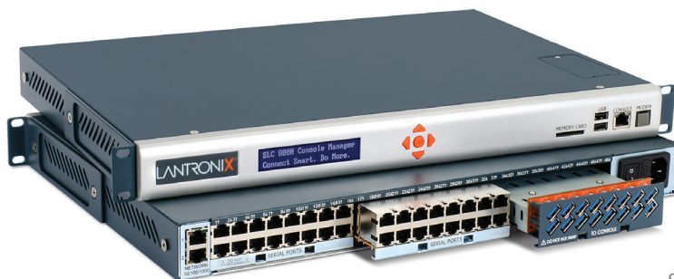
SLC™ 8000 Console Manager

All modern data centers are constructed with a high regard for physical security and efficiency. Nevertheless, there is an ongoing cost to the operation for each visitor entering the site: this expense can be mitigated by using secure remote access solutions from Lantronix providing benefits for data center operators and customers alike. One should consider Lantronix out-of-band Remote Environment Management products in these situations.