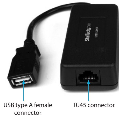
USB type A female connector