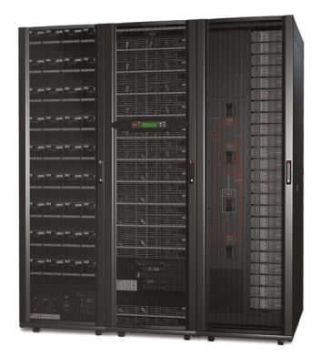
Symmetra PX 100 with 100 kVA modular PDU