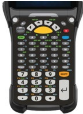
53 Key TE 5250