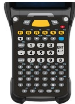
58 Key Func AN