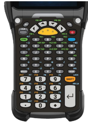
53 Key TE 3270