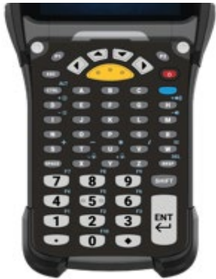
53 Key Standard