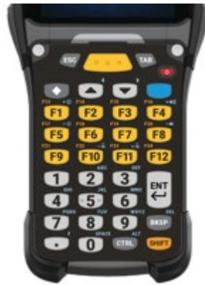
34 Key Function