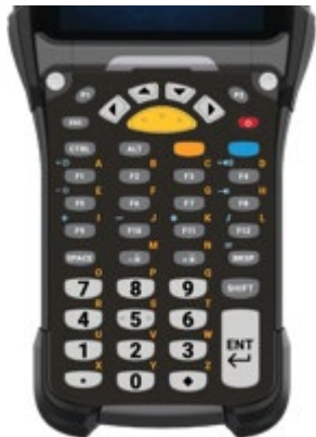
43 Key Function