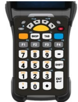
29 Key Function