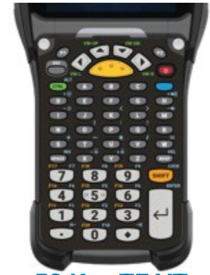
53 Key TE VT