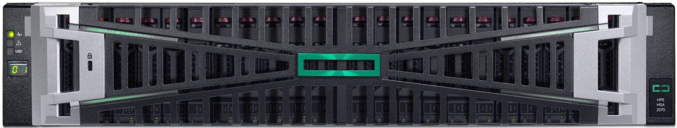
HPE MSA Gen7 Storage – Front View