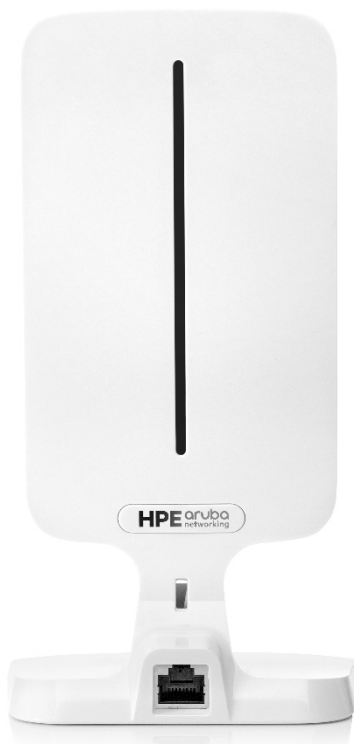
HPE Networking Instant On Access Points AP22D

Easily manage the HPE Networking Instant On AP22D with the HPE Networking Instant On mobile app or portal to create guest and employee networks, govern access control lists, and set POE schedules to customize power use. Make the most of your limited space in your small business by mounting the HPE Networking Instant On AP22D to a desk or wall with included mounting kits.