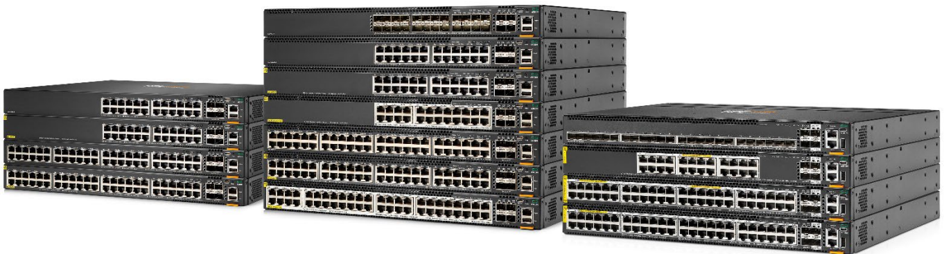
HPE Aruba Networking CX 6300 Switch Series

Dynamic Segmentation extends foundational wireless role-based policy capability to wired switches. What this means is that the same security, user experience and simplified IT management can be enjoyed throughout the network. Regardless of how users and IoT devices connect, consistent policies are enforced across wired and wireless networks, keeping traffic secure and separate.