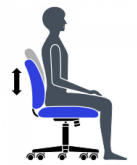
Back/Lumbar Height Adjustment