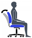
Back Angle Adjustment