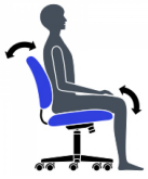
Chair Tilt Lock