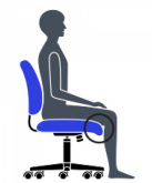
Waterfall Seat Edge