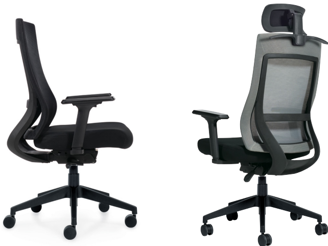
shown with optional headrest